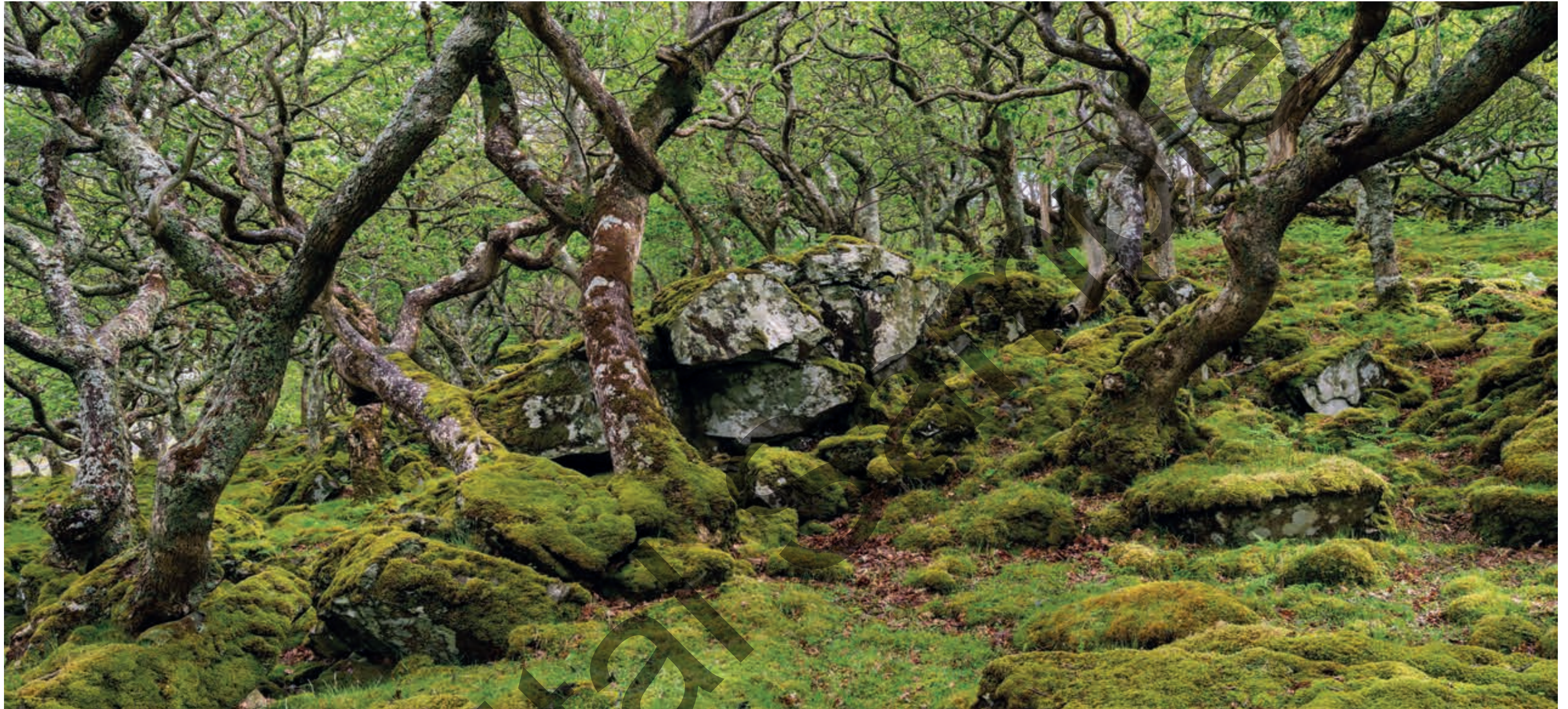
Scarisdale Wood, Knock Estate, Loch na Keal, Isle of Mull