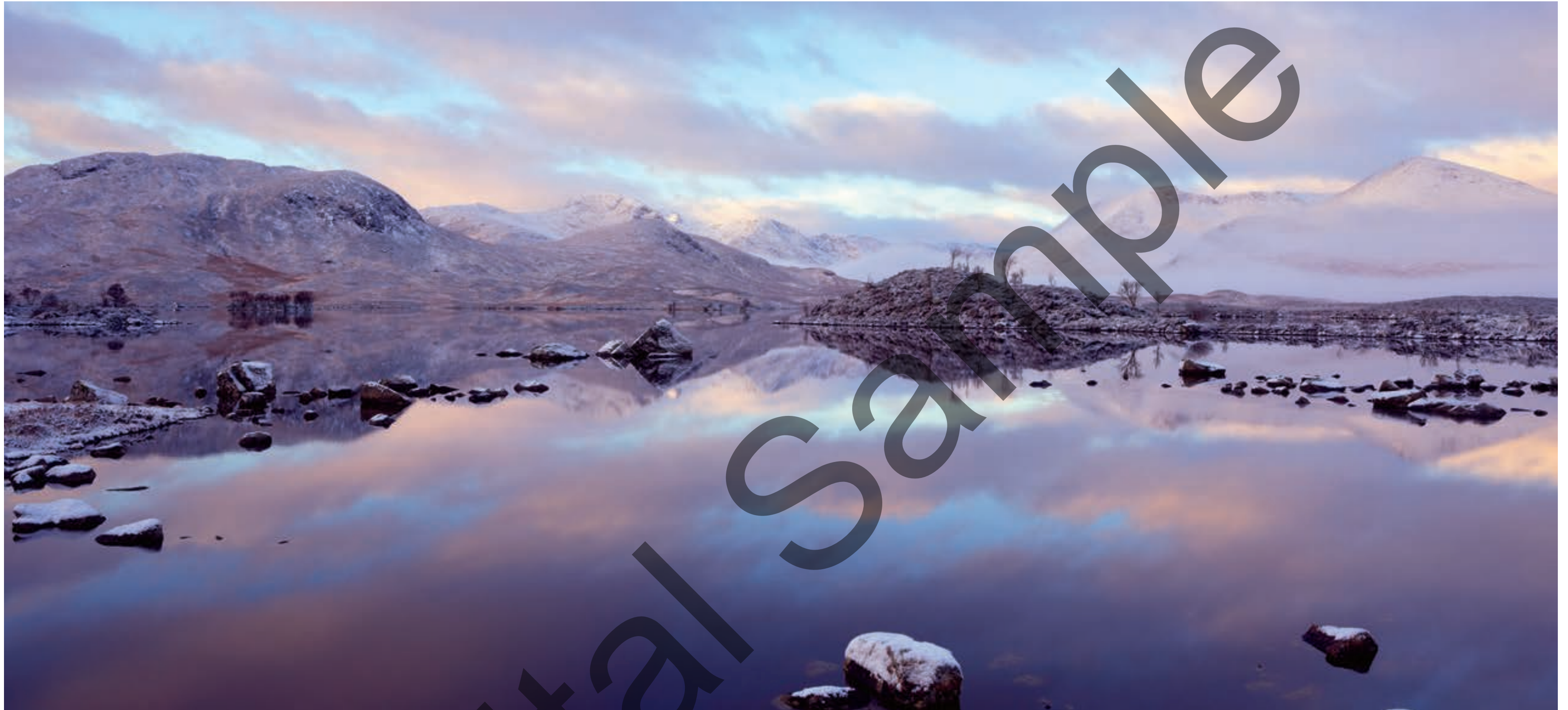
Black Mount, Lochan na h-Achlaise, Rannoch Moor