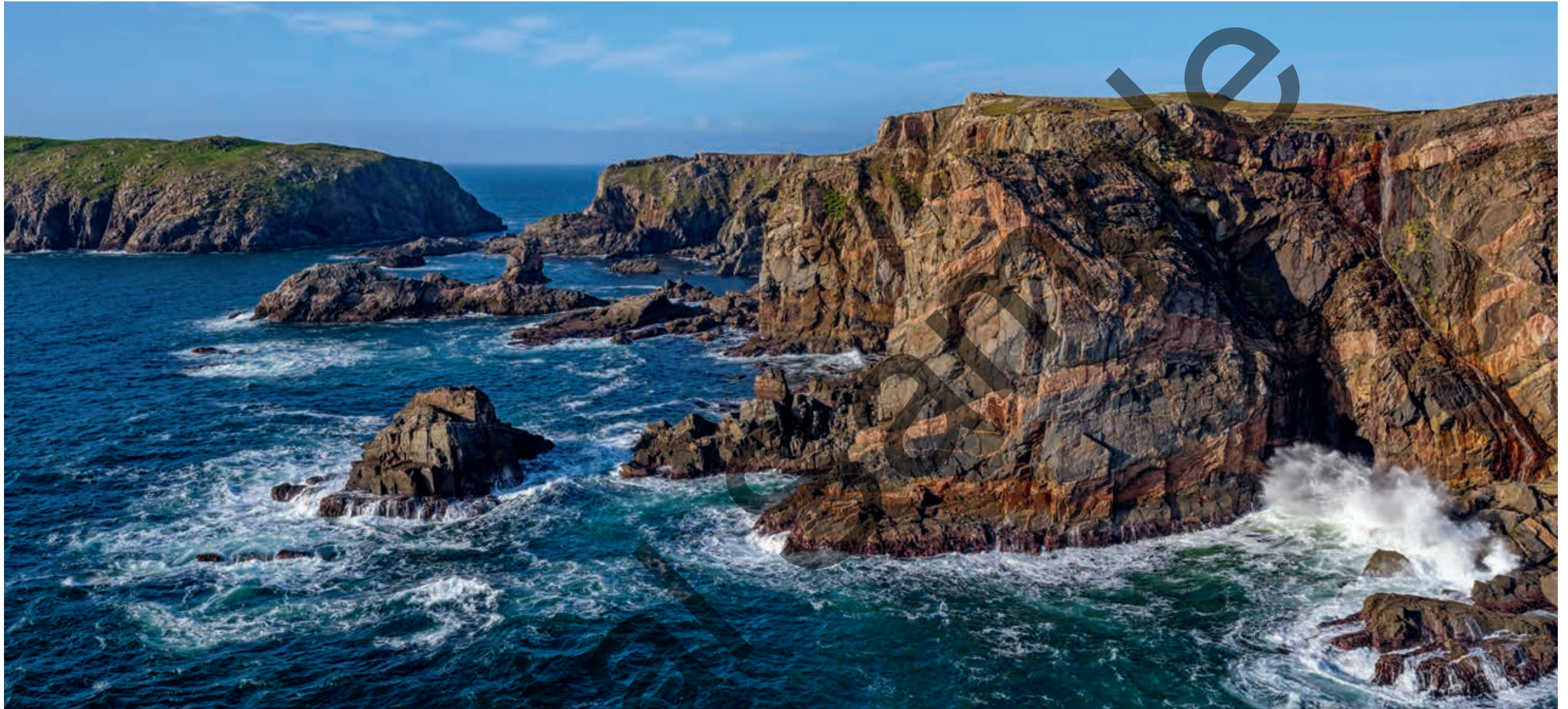
Leirigeo and Eilean Molach, Mangersta, Isle of Lewis