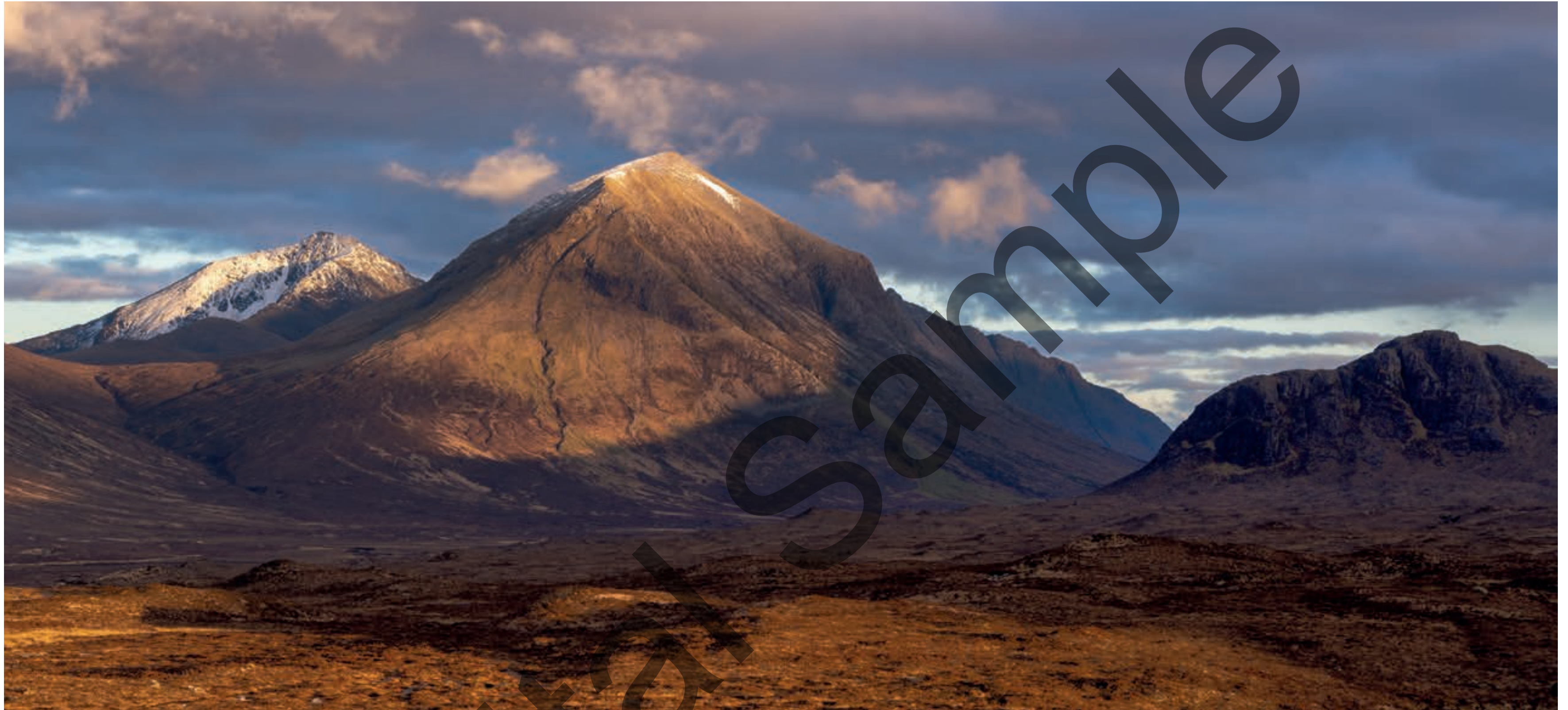
Garbh-bheinn and Marsco, Glen Sligachan, Isle of Skye