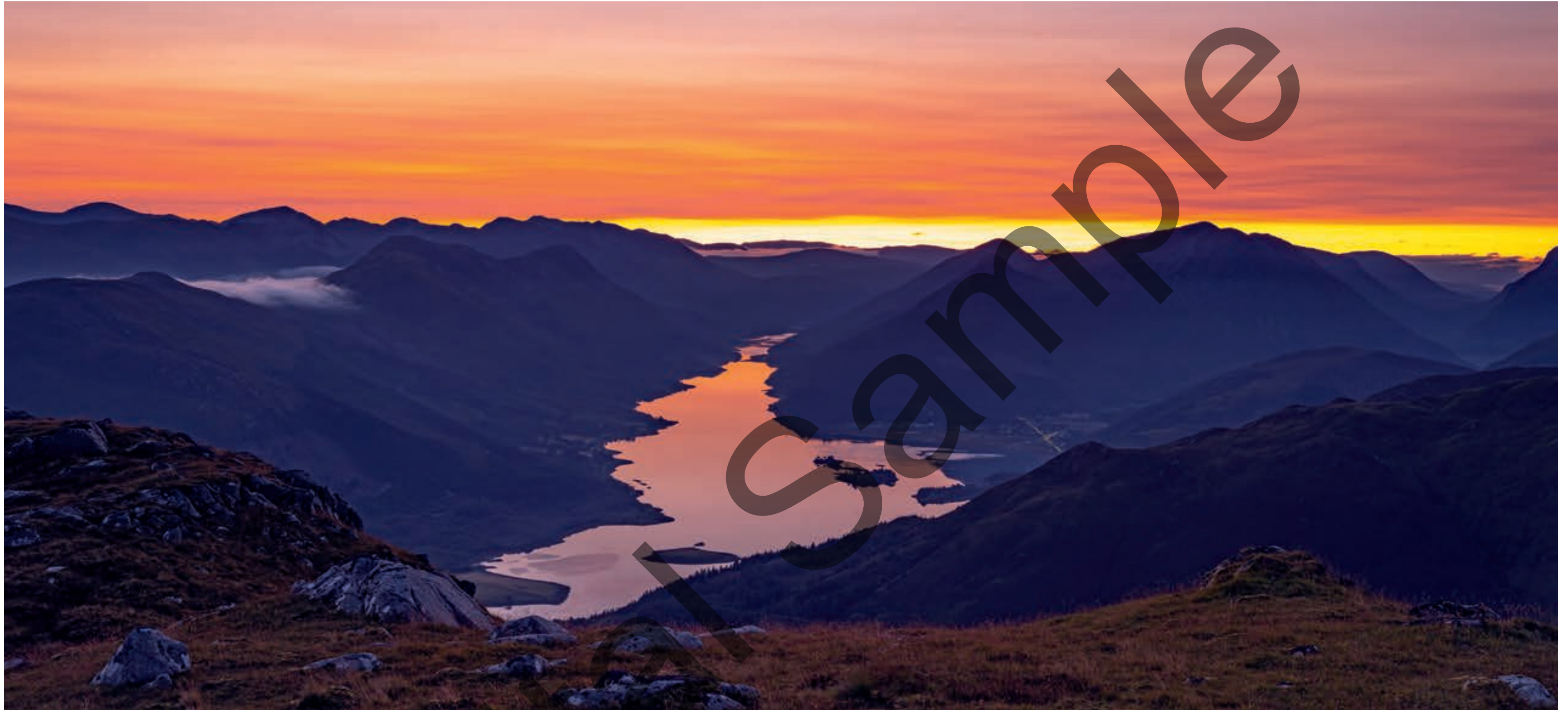
Loch Leven and the Pap of Glencoe, Glencoe