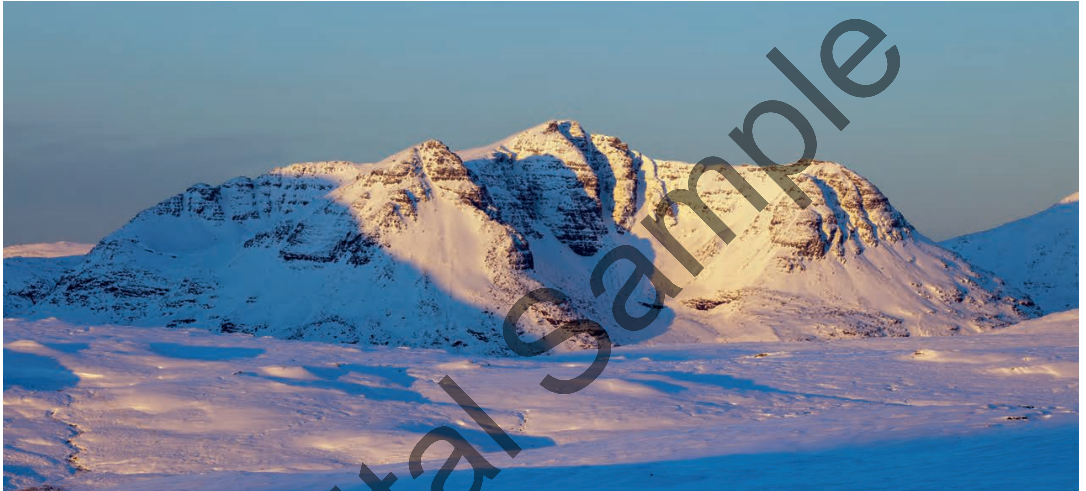
Beinn Dearg Mòr, Fisherfield Forest