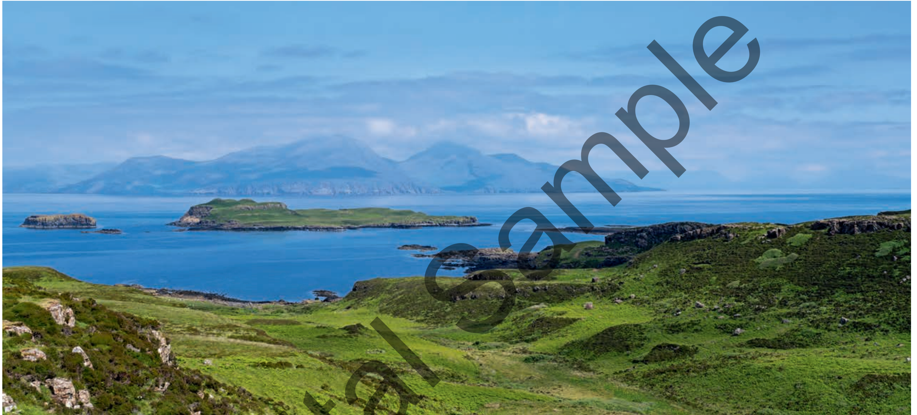
Horse Island and the Isle of Rùm, Gleann Mhairtein, Isle of Muck