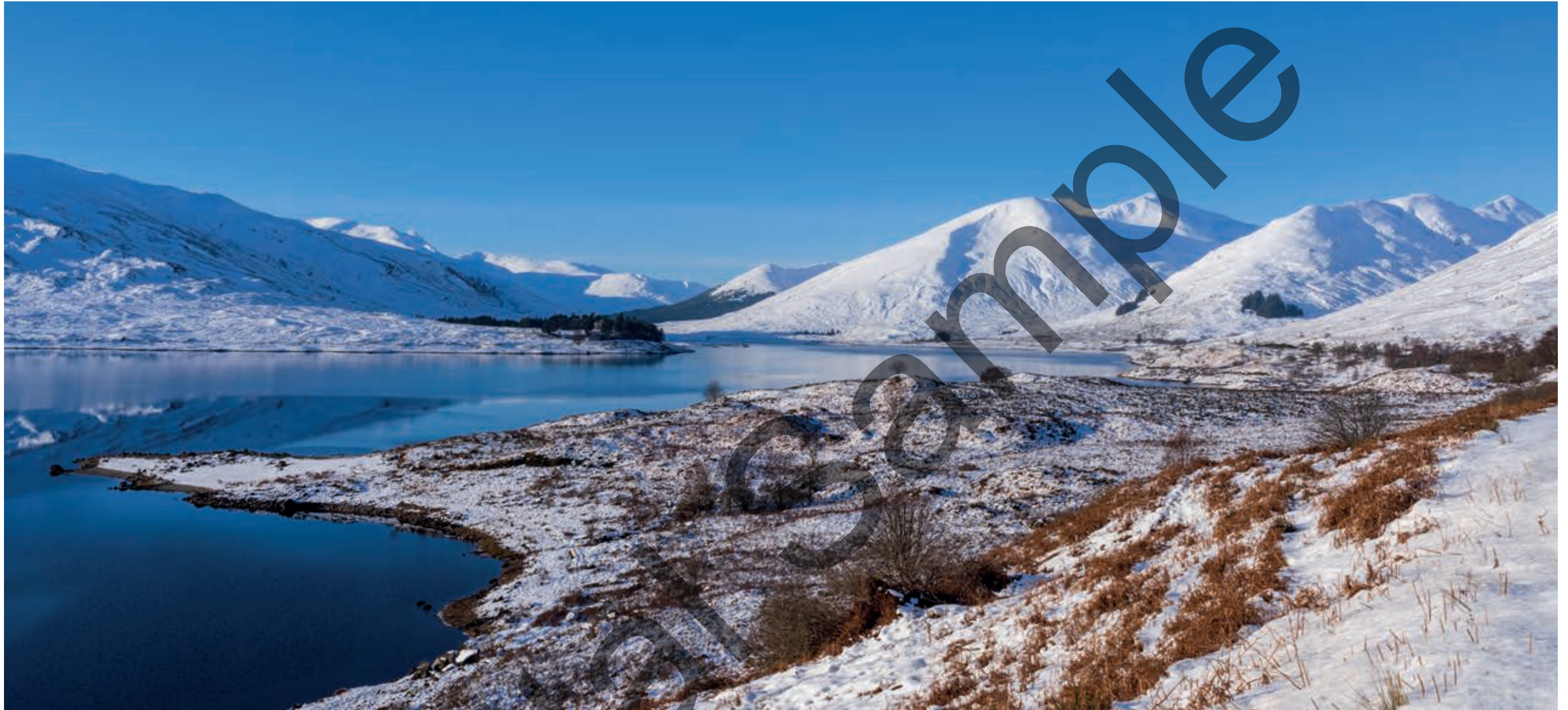
Aonach Meadhoin and Sgùrr an Fhuarail and Ciste Dubh, Loch Cluanie, Glen Shiel