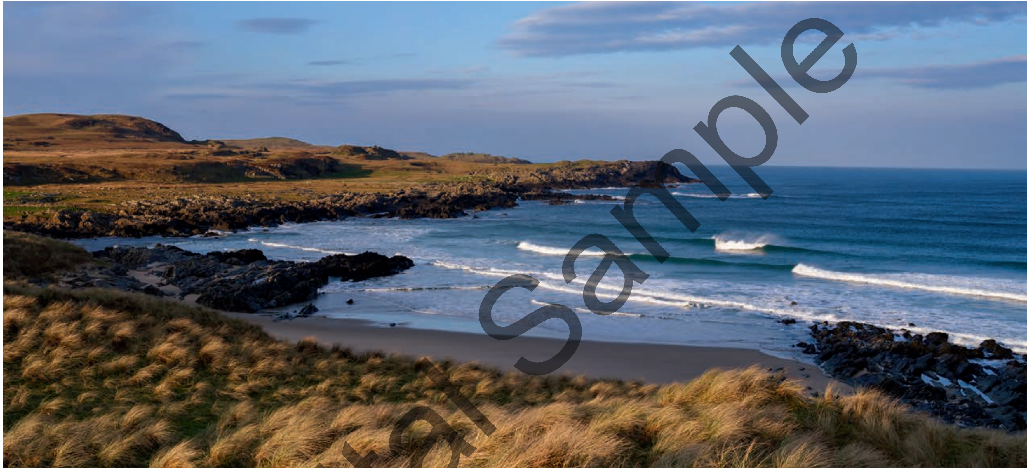
Saligo Bay, Rinns of Islay, Isle of Islay