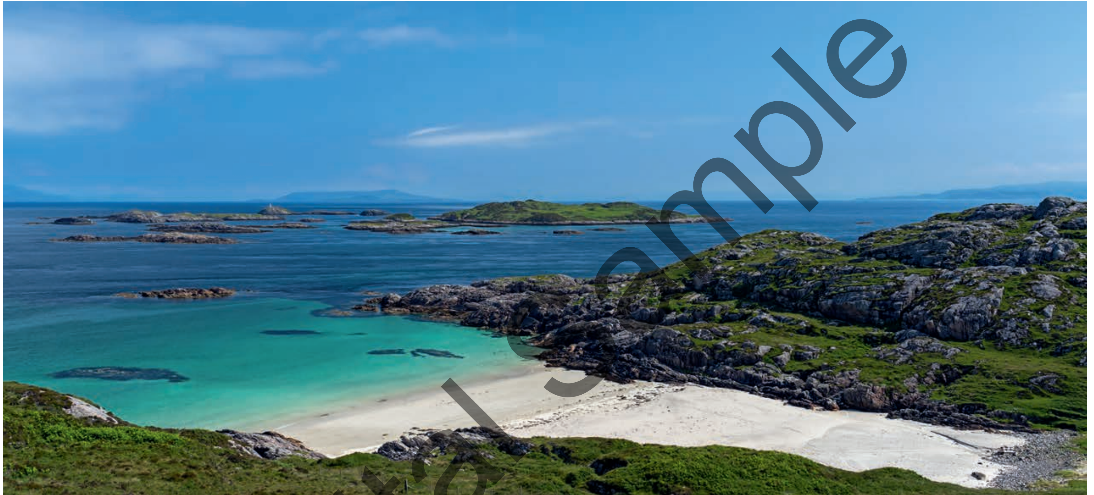
Eilean Mòr, and Eigg from Druim Nan Carn, Isle of Coll