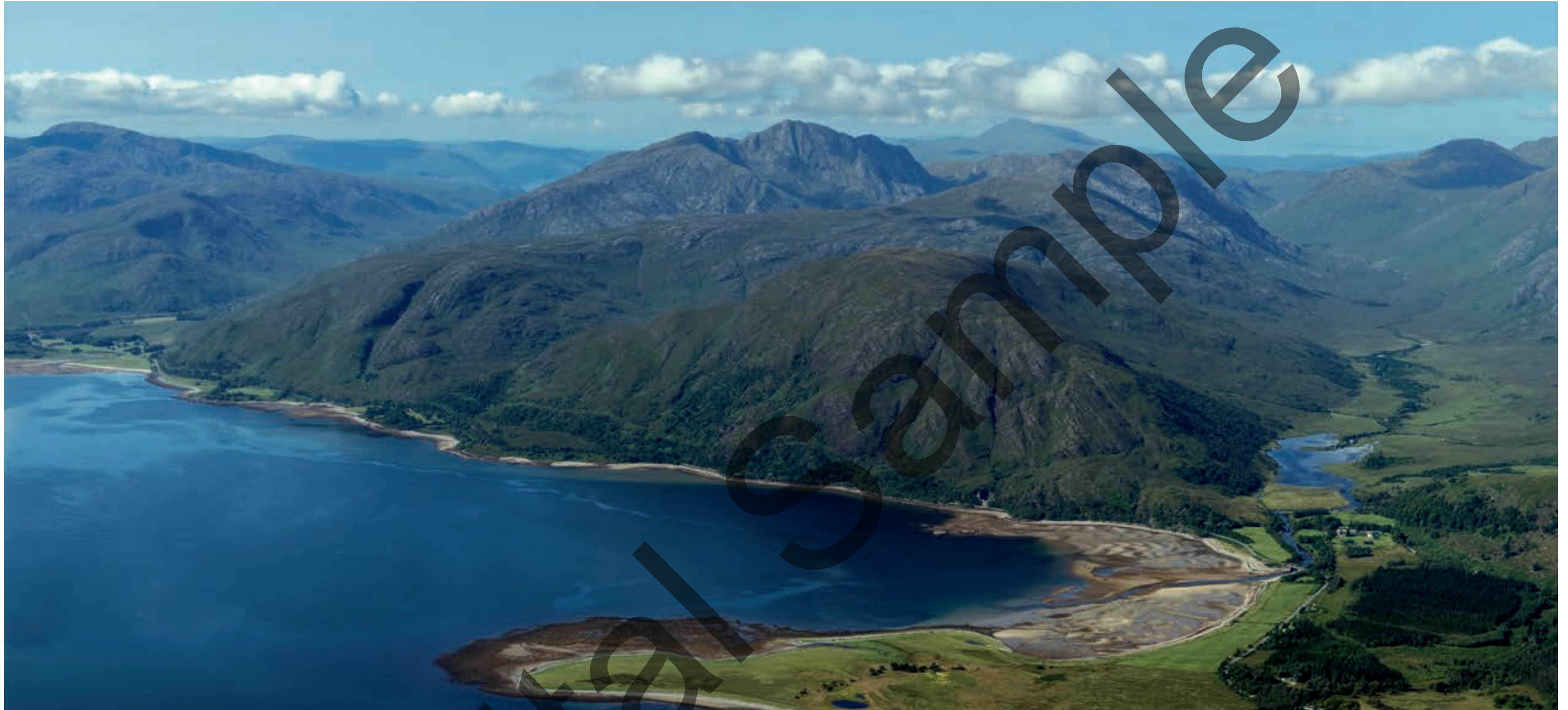
Garbh Bheinn and Glen Tarbert, Loch Linnhe, Ardgour