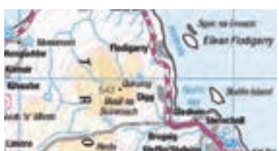
The Quiraing is a long ridge of vertical cliffs, jagged rock pinnacles and pillars forming a bizarre landscape above scenic Staffin Bay on Skye's Trotternish Peninsula. The formations include a 36m-high stack called the Needle; a hidden high plateau - the Table; and a pyramid-shaped crag - the Prison.