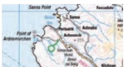
This stunning beach of pristine white shell sand, divided by rocky outcrops, backed by dunes and machair, is located on the isolated and rugged Ardnamurchan Peninsula, with superb views of the Small Isles of Coll, Eigg and Rum. Ardnamurchan Point is the westernmost place on the British mainland.